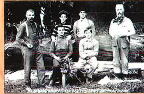
CRUISER Individual who walks through a forest measuring the trees to estimate the volume of wood available for harvest. They survey the trees for quality and density.