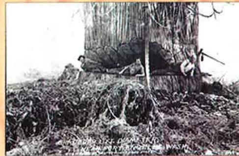
BUSHLER A person who fell trees or cut logs and was paid by the volume of logs produced. This was and continues to be one of the most dangerous jobs in the woods.