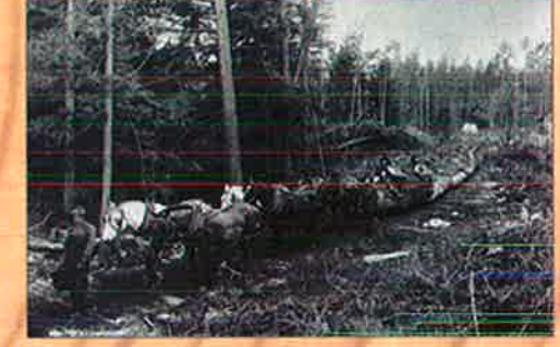
CORDUROY ROAD A road made out of small logs placed parallel to each other (like railroad ties), on which larger, marketable logs were dragged to the landing.