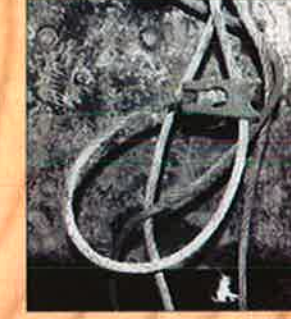
CHOKER Portable cables used to fasten log(s) to the rigging to be hauled to the landing. The person attaching the choker to the log(s) is called the choker setter.