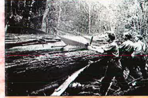
MISERY WHIP Also known as a Swedish Fiddle, these are long cross-cut saws used by one or two men to fall trees or cut trees into logs.