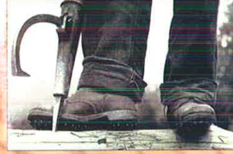
CAULK OR CORK BOOTS Leather boots with high ankle support and nails on the soles. They are used to walk on logs. The peavey is used to roll logs.