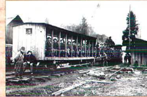
CRUMMY The rail car, with long benches on both sides, used to travel between the logging camps and the woods. Today, the crummy is the vehicle used to haul the loggers to and from the work site.