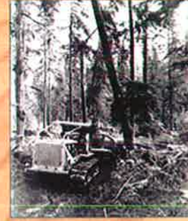
CAT SKINNER Tractor or bulldozer operator at a logging operation.