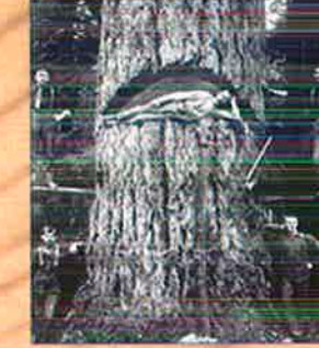
SPRINGBOARD A tapered wooden plank with an iron cleat on one end. Placed in slots cut into the base of large trees, they allowed fallers to get above the curved grain in the base of the tree.