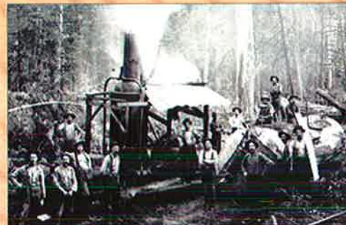
RIGGING CREW The rigging crew was composed of the donkey puncher, whistlepunk, hook tender, and choker setters. The donkey puncher operated the steam donkey. The whistlepunk coordinated the logging operation with the choker setters through a series of whistle codes designed to keep the operation safe. The hook tender planned and installed the cables used to yard (haul) the logs from the forest to the landing.