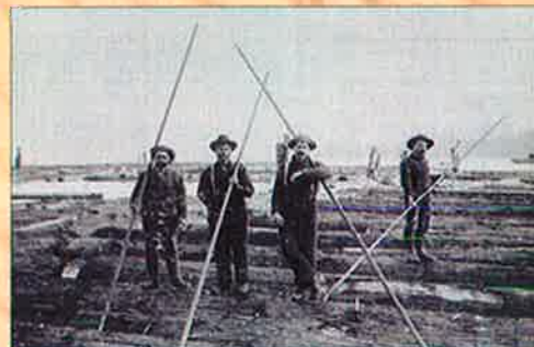
BOOM TENDER A person working on a log raft in the booming ground. Their job was to sort logs and assemble them into rafts for shipment or processing. The job required walking on the floating logs and they wore caulk boots for stability.