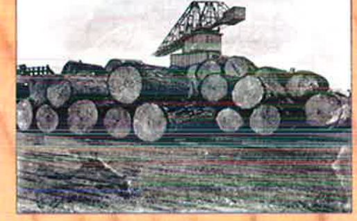
COLD DECK Stack of logs at a landing, log yard or saw mill waiting for shipment or processing.