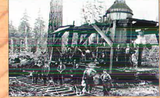
STEAM DONKEY A wooden sled mounted with a steam engine and two or three drums spooled with heavy cable. It was used to move logs and equipment through the forest. The donkey was moved by simply dragging itself with its own cables.