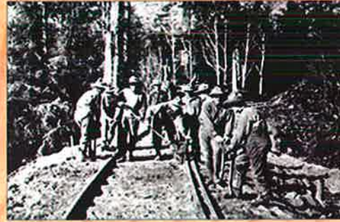
GANDY DANCER A laborer who helped with the maintenance and construction of a railroad.