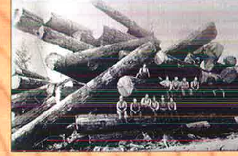
LANDING Logs are brought from the forest and accumulated at this location for transport to markets.