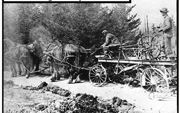
Road Grading near Joyce circa 1905

By mid-June there will be about 17 hours of daylight.