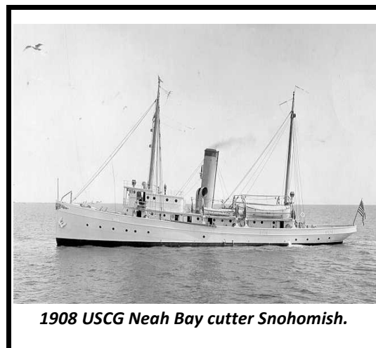
1908 USCG Neah Bay cutter Snohomish.